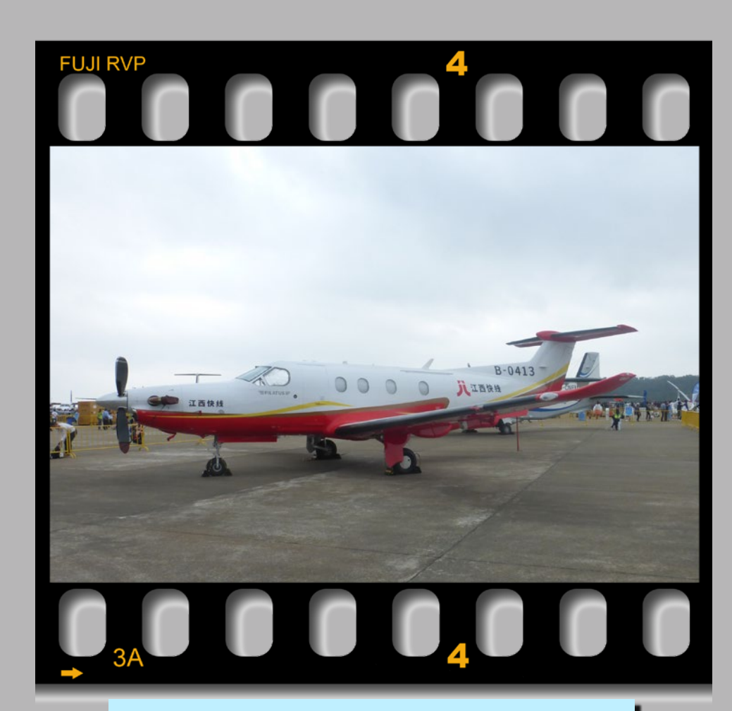
Pilatus PC-12/47E, Yajie General Aviation (above)