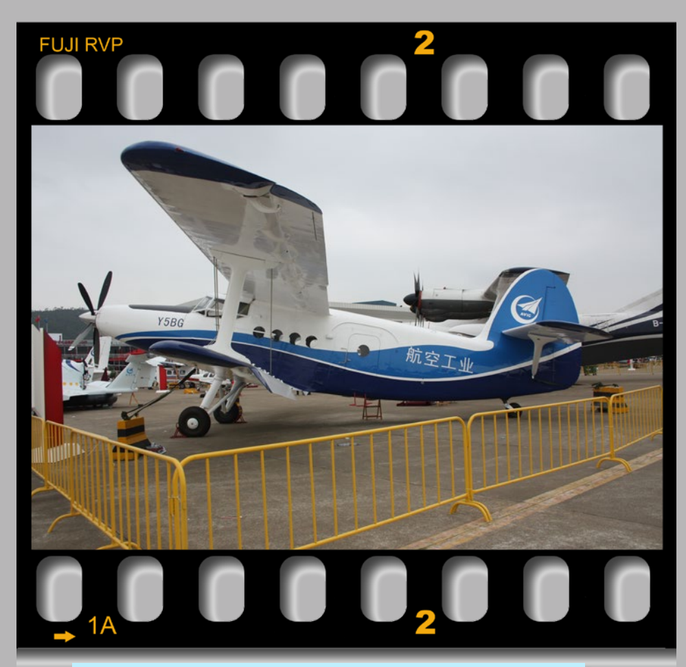
The AVIC Y5B6 is a Chinese licence built Antonv An-2. This particular aircraft is equipped with a Honeywell TPE331-UAN turbo-prop engine (above)