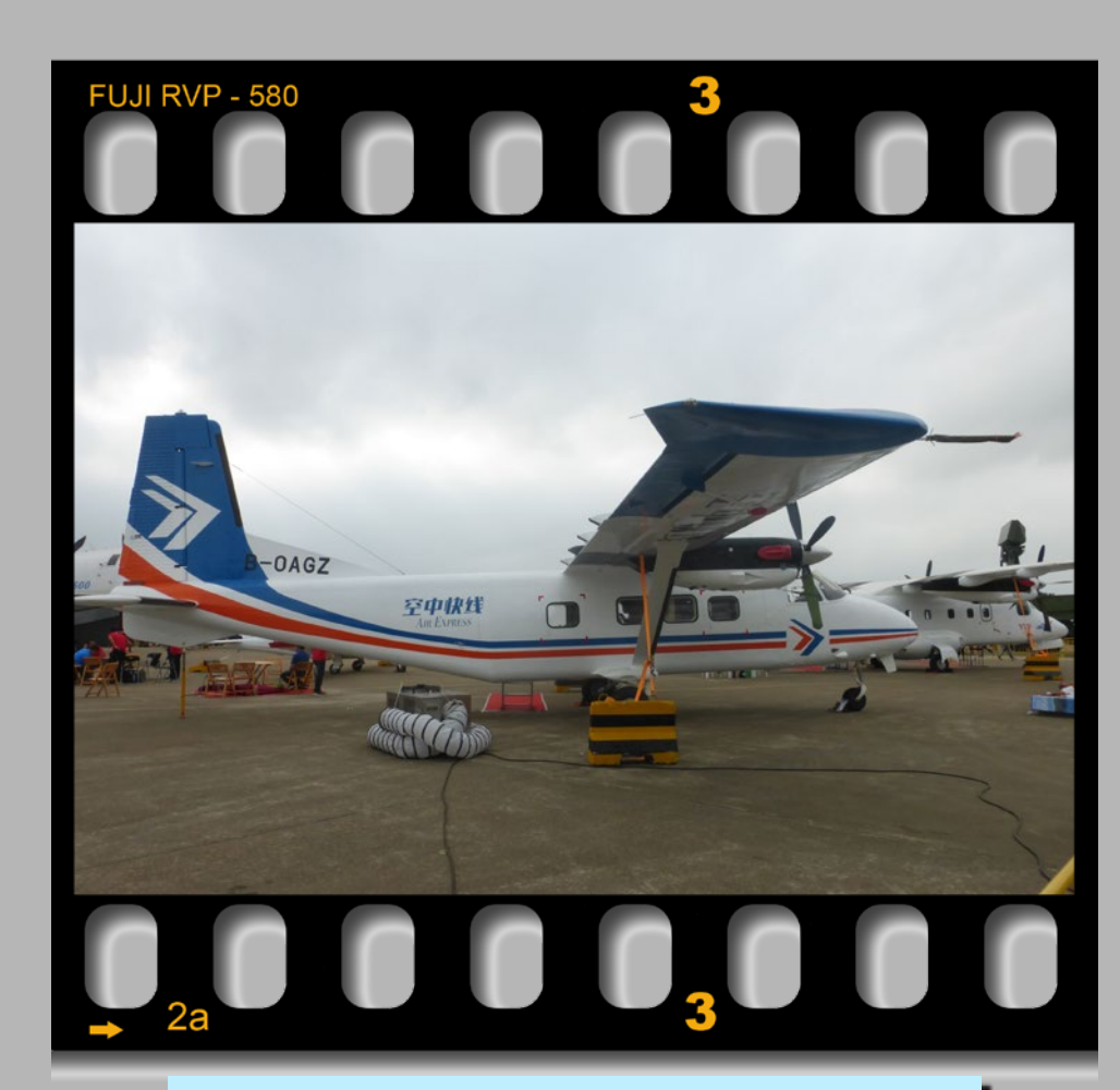
Harbin Y-12E, Air Express Airline (above)