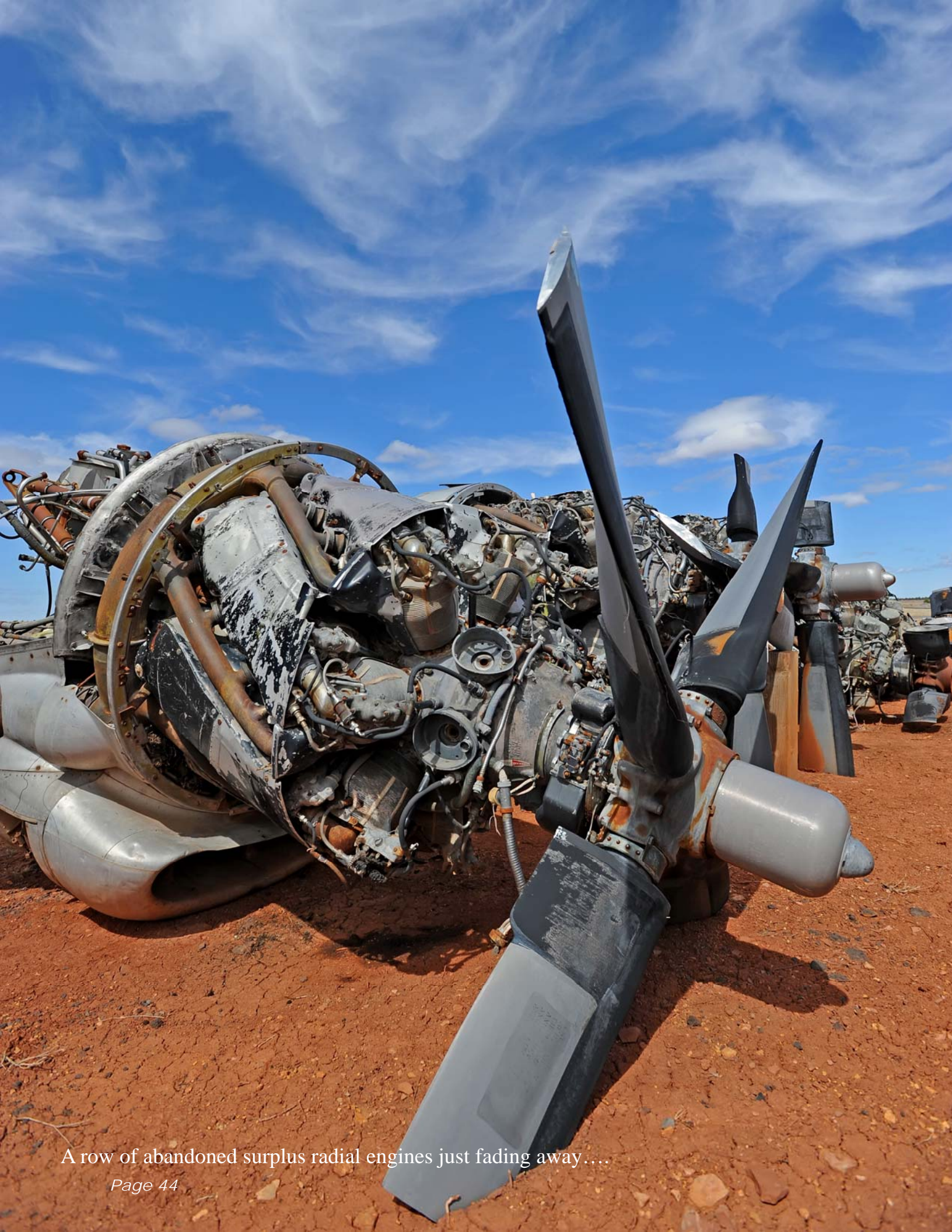
A row of abandoned surplus radial engines just fading away....

The perfect gift for the Aviation enthusiast or even for yourself!