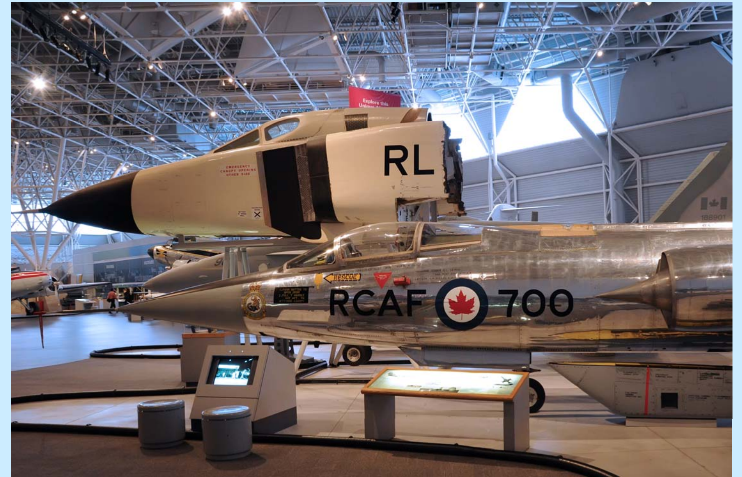
The Avro Canada CF-105 Arrow 2 nose, and Lockheed F-104A Starfighter, above. The WWII German Heinkel He 162A-1 Volksjager under the wing of the Avro Lancaster X, below.