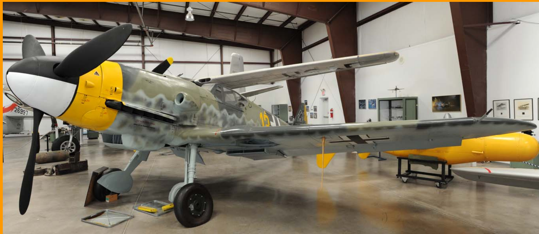
The Messerschmitt Bf-109G Gustav, above. A rare WWI fighter Siemens-Schuckert D. IV to the right. The Grumman G-32A was the last American biplane fighter aircraft delivered to the United States Navy, and served between the wars, below and to the right.