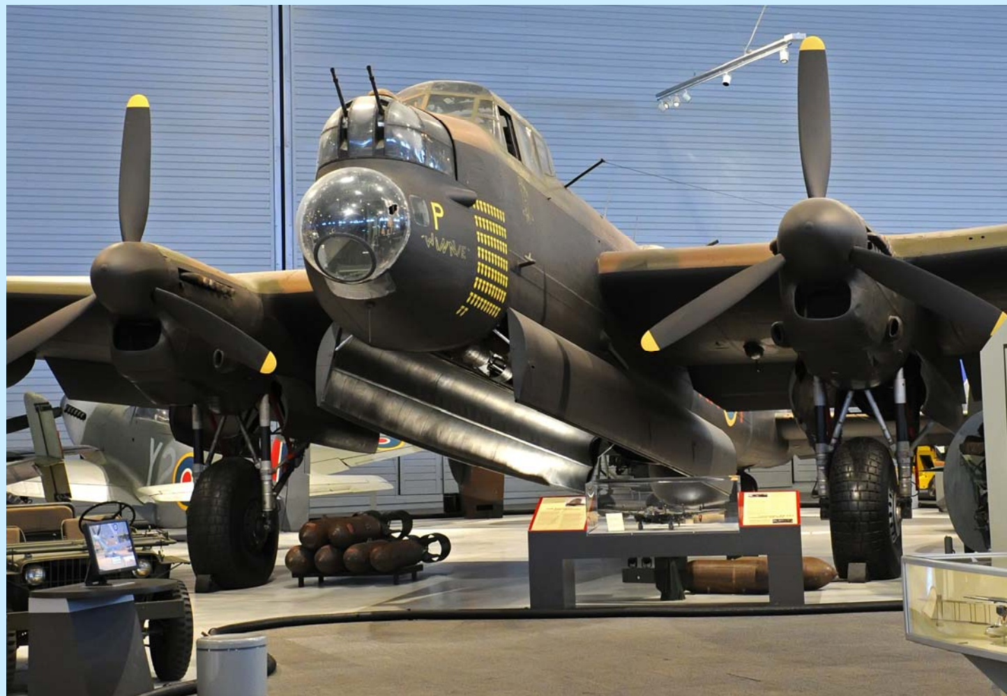
The majestic Avro Lancaster X above. The vertical lift section in the museum on the image below left to right are visible: The Canadair CL-84, CH-133 Labrador, Bell HTL-6, Sikorsky HO4S-3, and the Piasecki HUP-3.