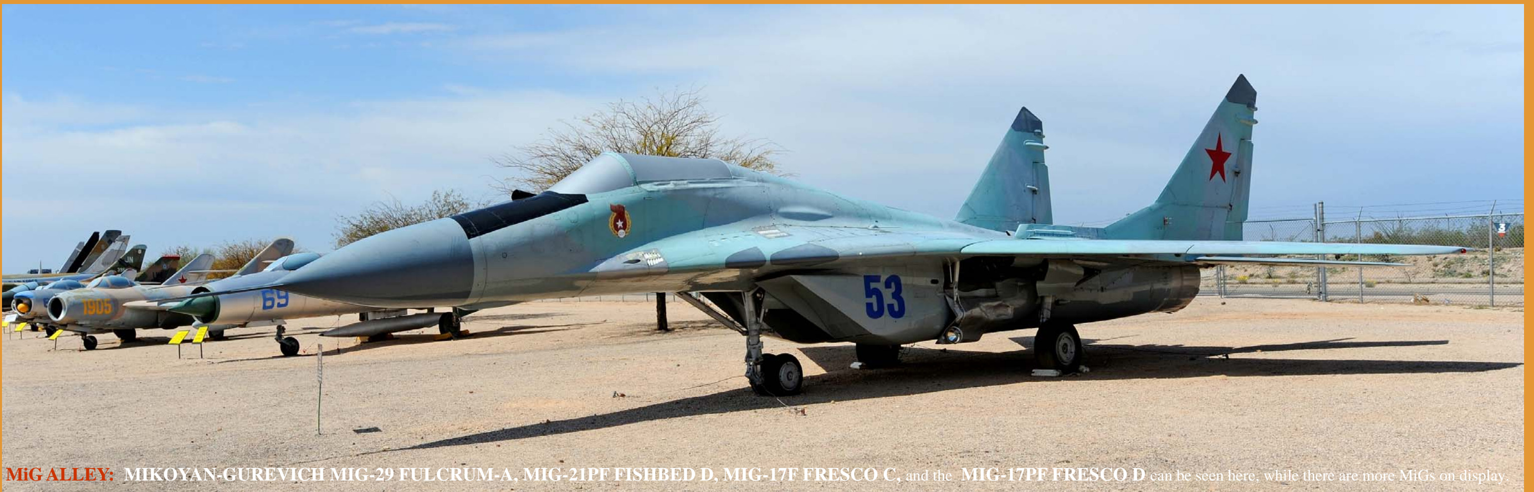
MiG ALLEY: MIKOYAN-GUREVICH MIG-29 FULCRUM-A, MIG-21PF FISHBED D, MIG-17F FRESCO C, and the MIG-17PF FRESCO D can be seen here, while there are more MiGs on display.