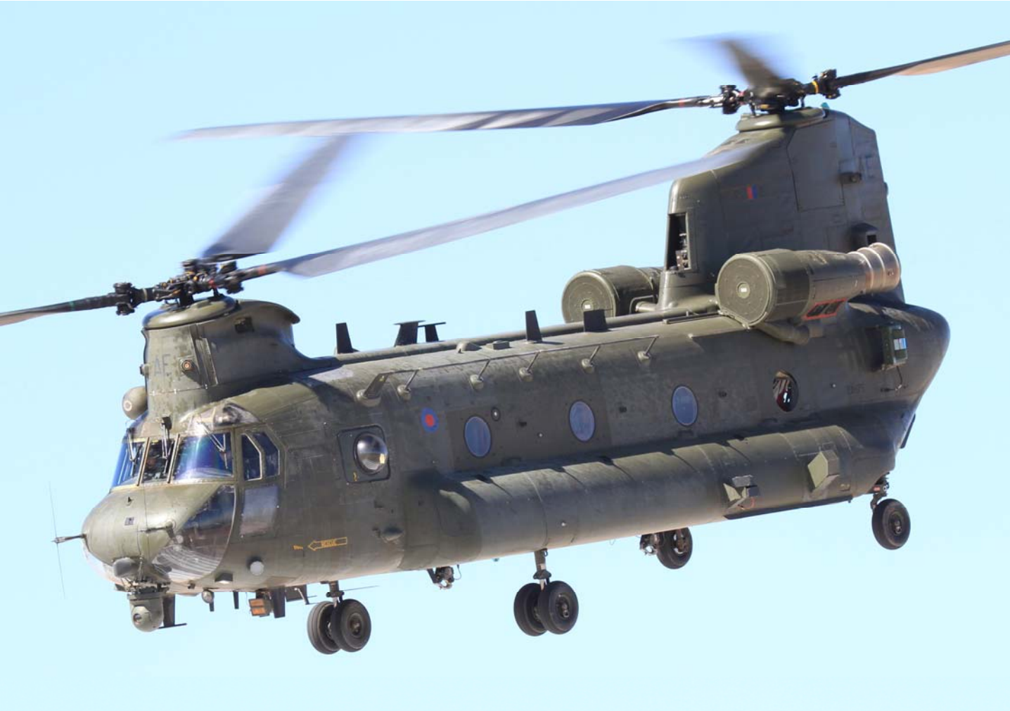
CH-47D Chinook, No.7 Squadron RAF, AE ZA675 F-18D Hornet, VFA-106 "Gladiators", NAS Oceana