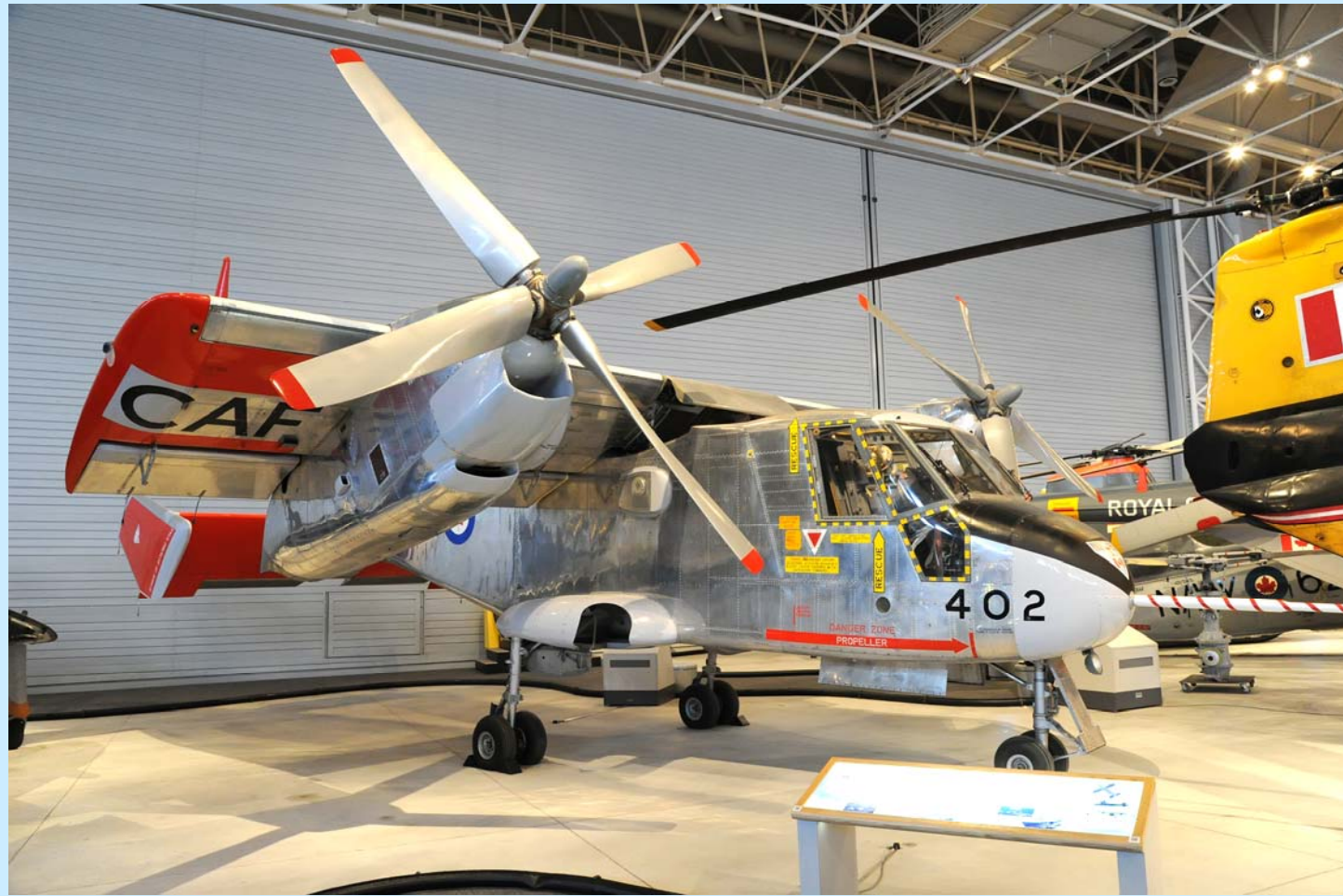
The Canadair CL-84 The Canadair CL-84 "Dynavert", designated by the Canadian Forces as the CX-131, was a V/STOL turbine tilt-wing monoplane designed and manufactured by Canadair between 1964 and 1972. Only four of these experimental aircraft were built with three entering flight testing, above. The WWII German Me 163B-1a Komet, rocket powered fighter, below.