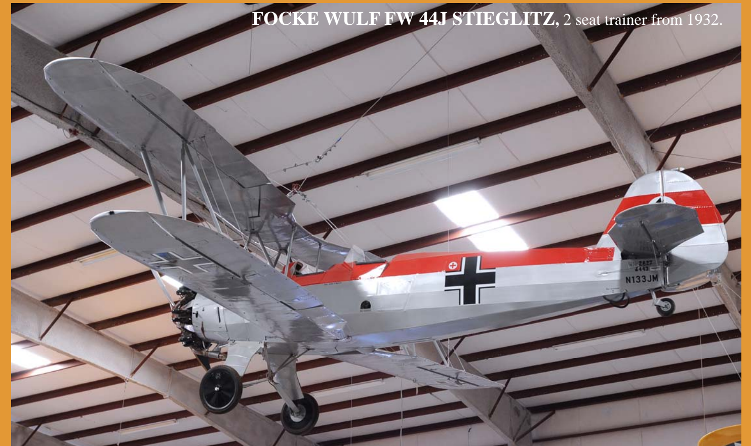
FOCKE WULF FW 44J STIEGLITZ , 2 seat trainer from 1932.