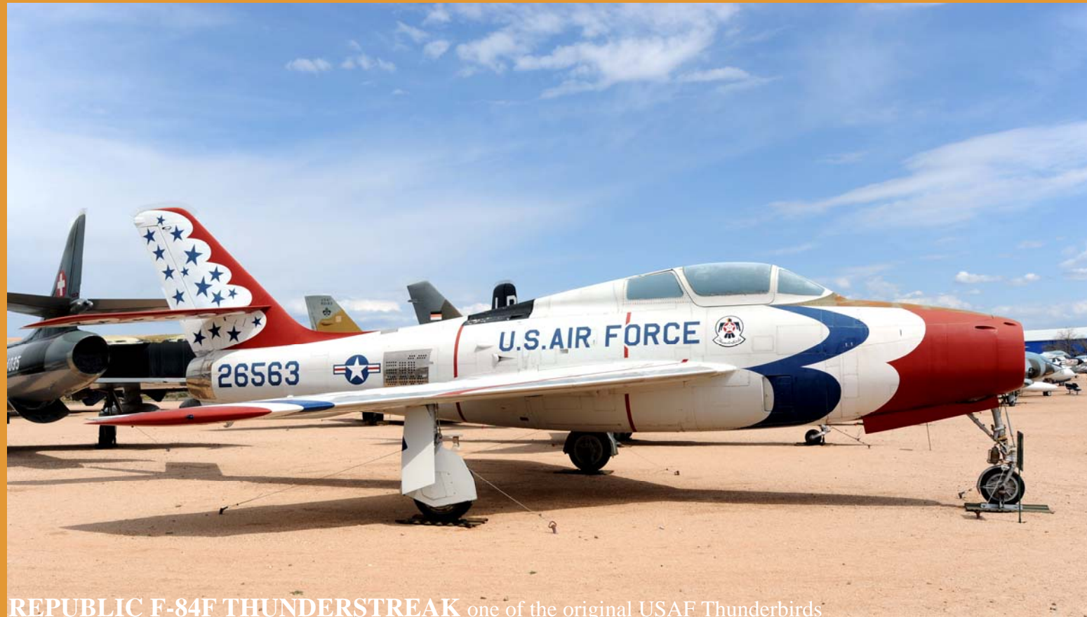
REPUBLIC F-84F THUNDERSTREAK one of the original USAF Thunderbirds