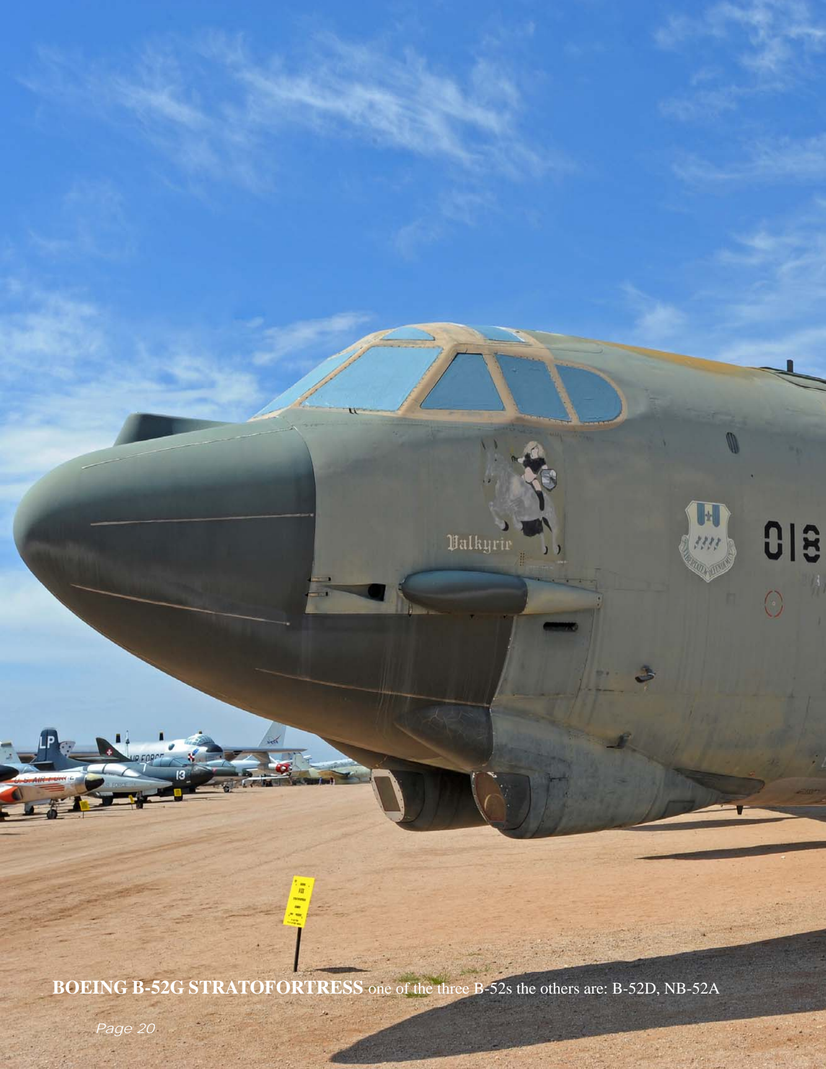
BOEING B-52G STRATOFORTRESS one of the three B-52s the others are: B-52D, NB-52A