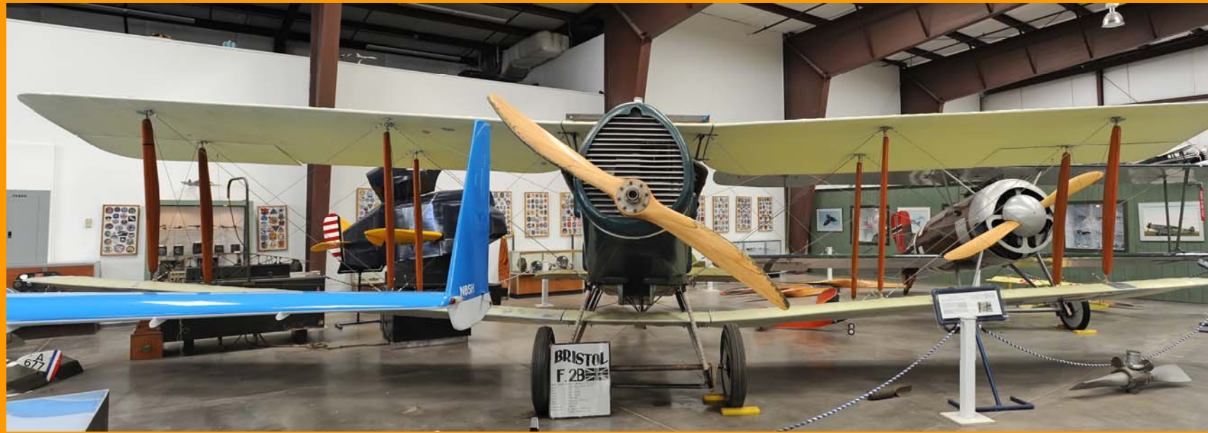
The above Bristol F.2b is a replica of the famous WWI fighter, and also on the right. Outside just behind the main Museum building one can find a Lockheed Shooting Star T-33A with Japanese markings, below and to the right. Note the additional parts of other aircraft stored behind the T-33A.