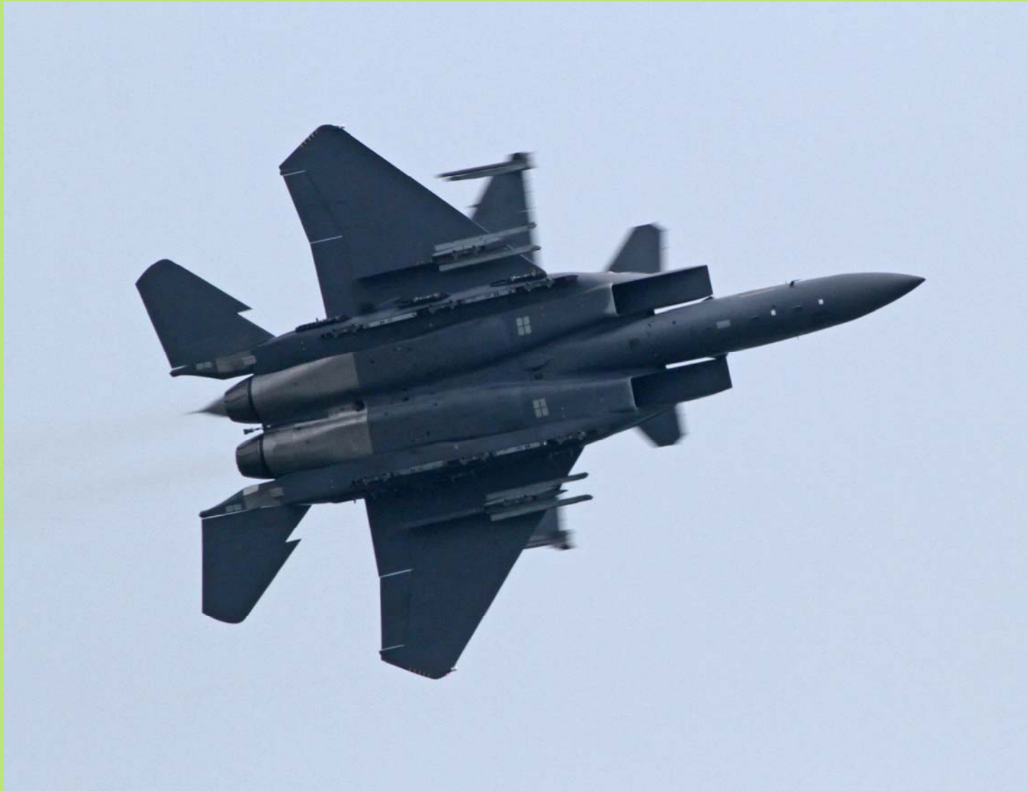
The F-15 and F-16 of the RSAF crossing over each, above. The F-16 of the Republic of Singapore Air Force on display, below. Tony Blair performing solo aerobatics in his Rebel-300, top right. The RMAF MiG-29N/UB pulling vapour and leaving a trail of smoke too, right bottom.