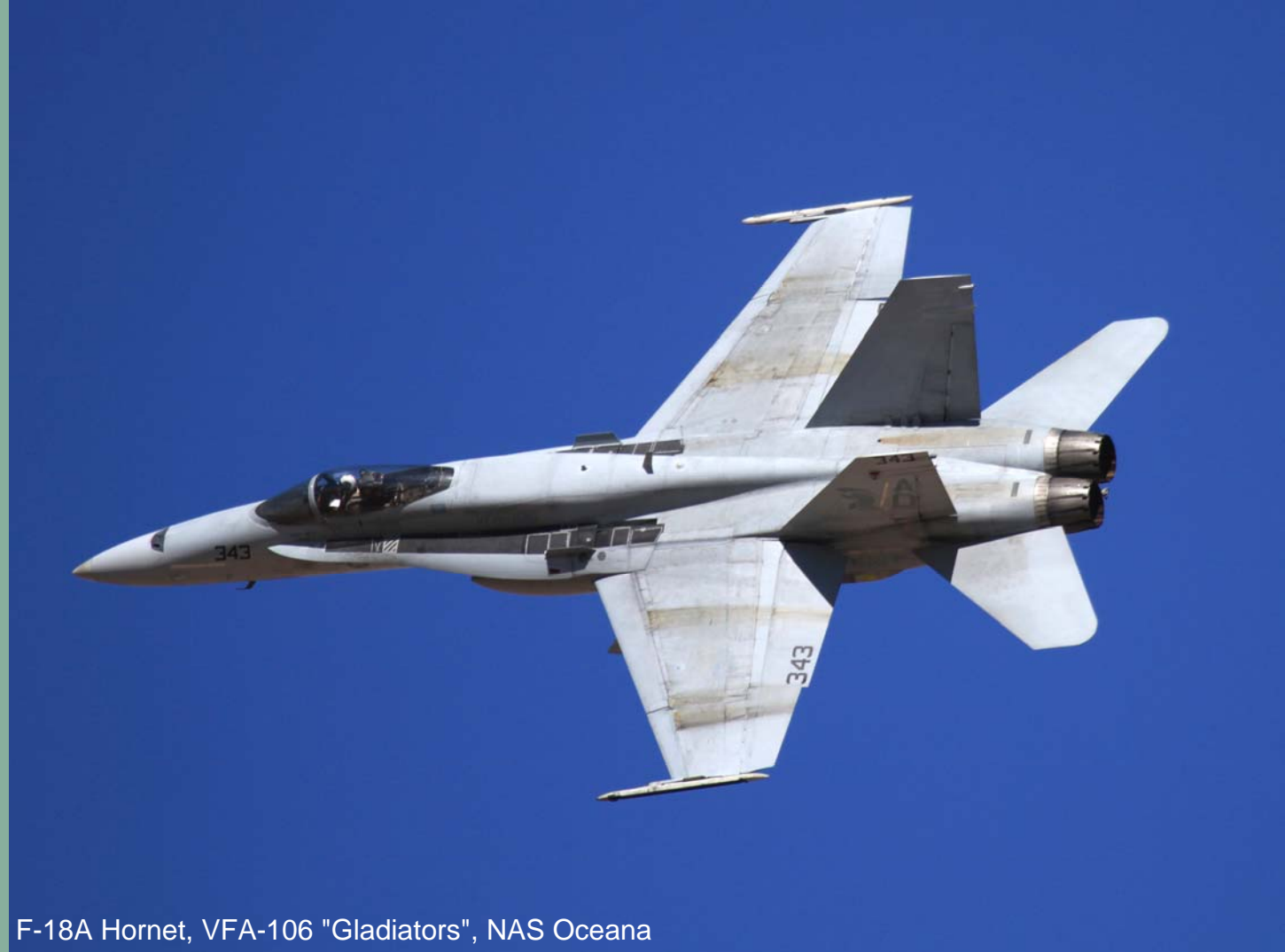
F-18A Hornet, VFA-106 "Gladiators", NAS Oceana AV-8B Harrier II, VMA-513 "Flying Nightmares", MCAS