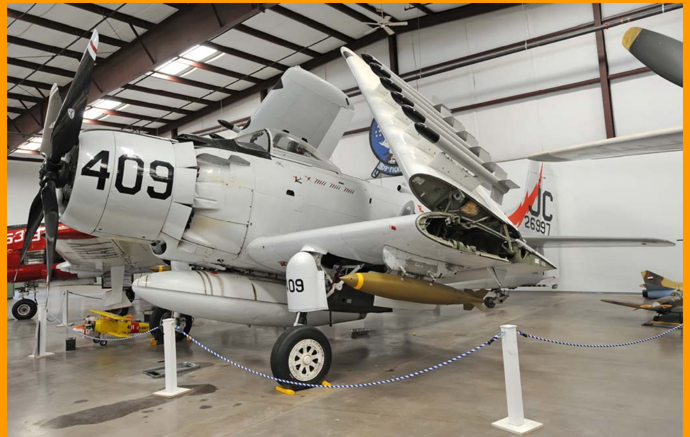
Douglas RB-26C Invader, above. The Douglas AD-4N Skyraider to the right.