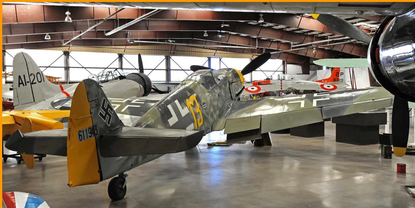
A very rare original Messerschmitt Bf-109G Gustav, below and to the right.