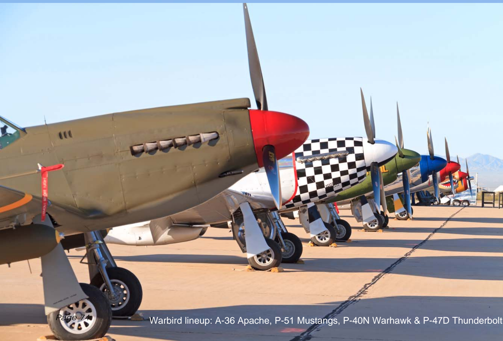
Warbird lineup: A-36 Apache, P-51 Mustangs, P-40N Warhawk & P-47D Thunderbolt