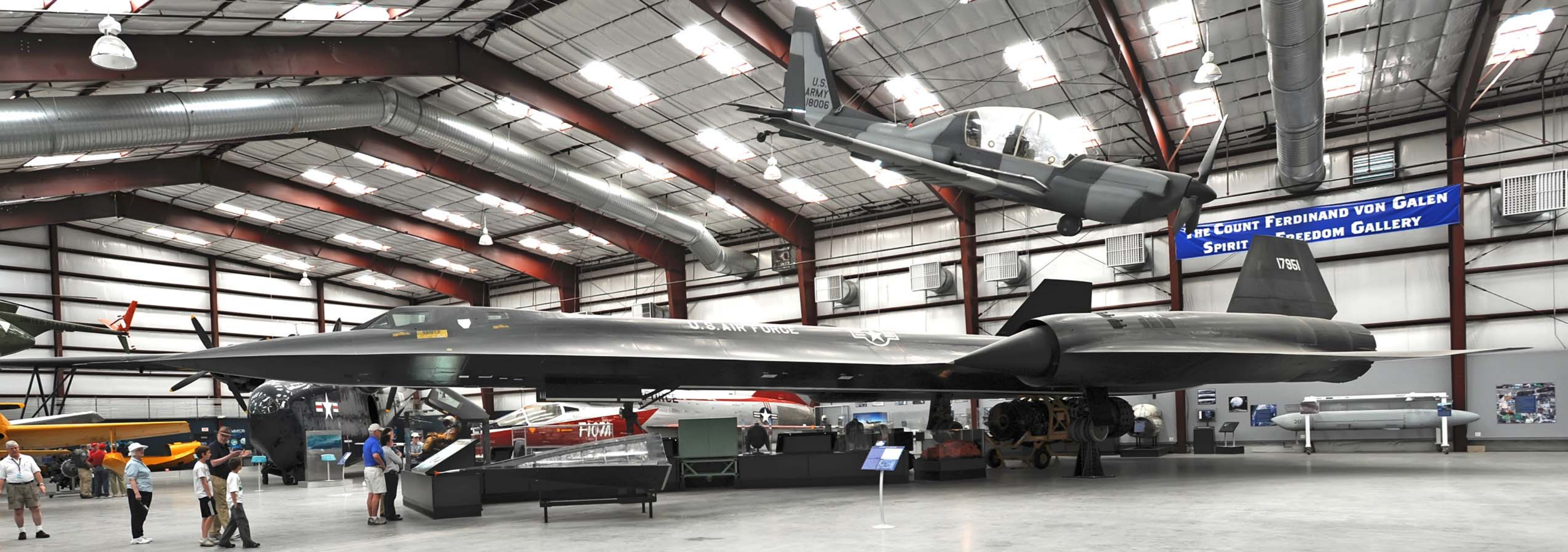
LOCKHEED SR-71A BLACKBIRD Serial Number: 61-7951. Markings: U.S. Air Force.

The last of a small family of aircraft built by Lockheed's famous Skunk Works, the SR-71 is one of the most recognized aircraft ever built. Design of what would become the Blackbird began in 1958 with a request from the CIA for an aircraft to replace the Lockheed U-2. The aircraft the CIA got was a single seat, twin engine, delta-winged design called the A-12. Even though the other versions of the Blackbird were known publicly the existence of the A-12 remained secret until 1982. The type made its first flight from the Groom Lake, Nevada test site in April 1962. Further development resulted in three different 2 seat versions; the YF-12 interceptor, the M-12 which carried the D-21 drone, and the SR-71