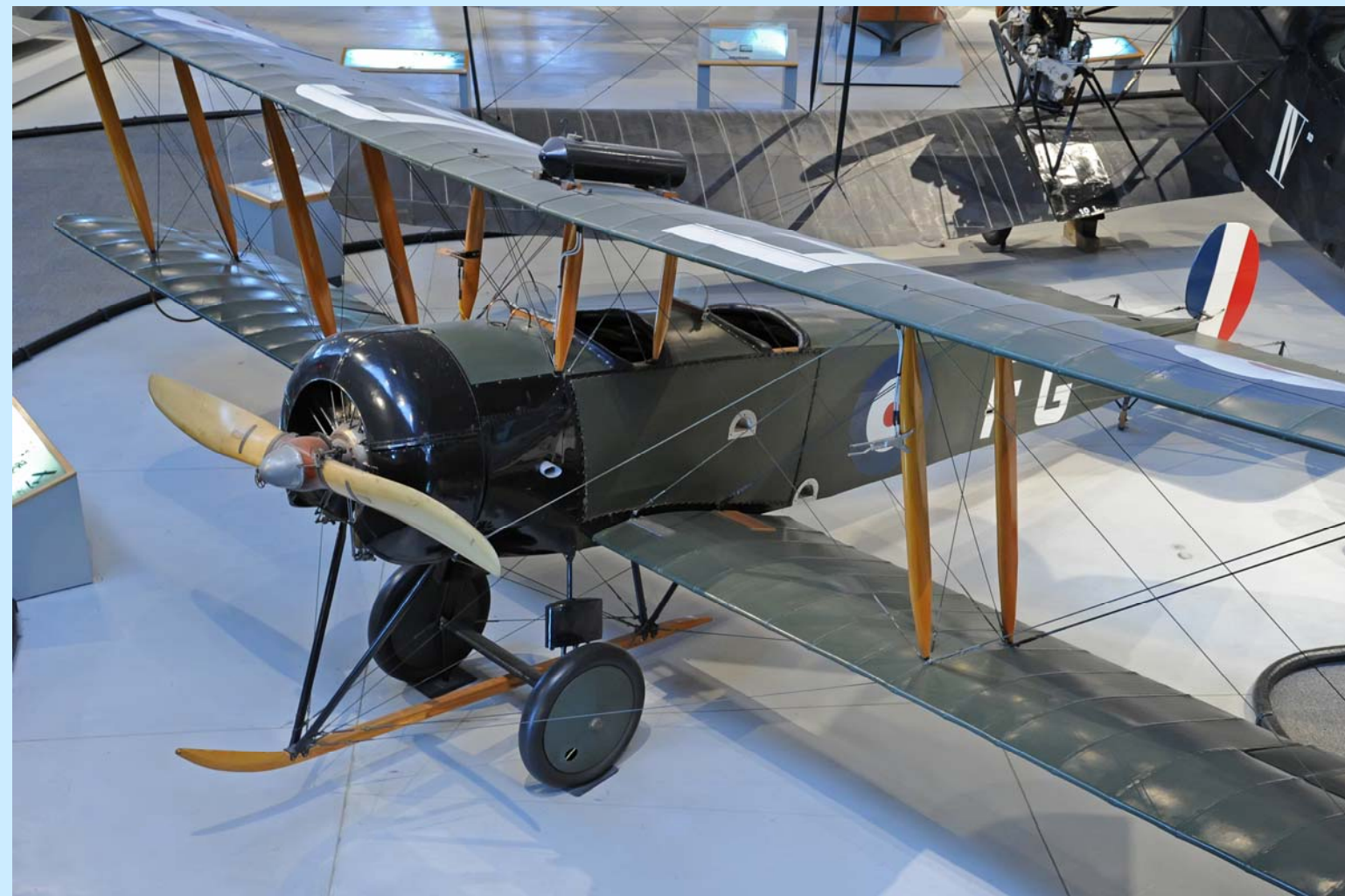
The Avro 504K was a World War I 2 seat trainer biplane, above. The AEG G.IV was a biplane bomber aircraft used in the World War I by Germany, below. This example is significant not only as the only one of its kind in existence, but as the only preserved German, twin-engine combat aircraft from World War I.