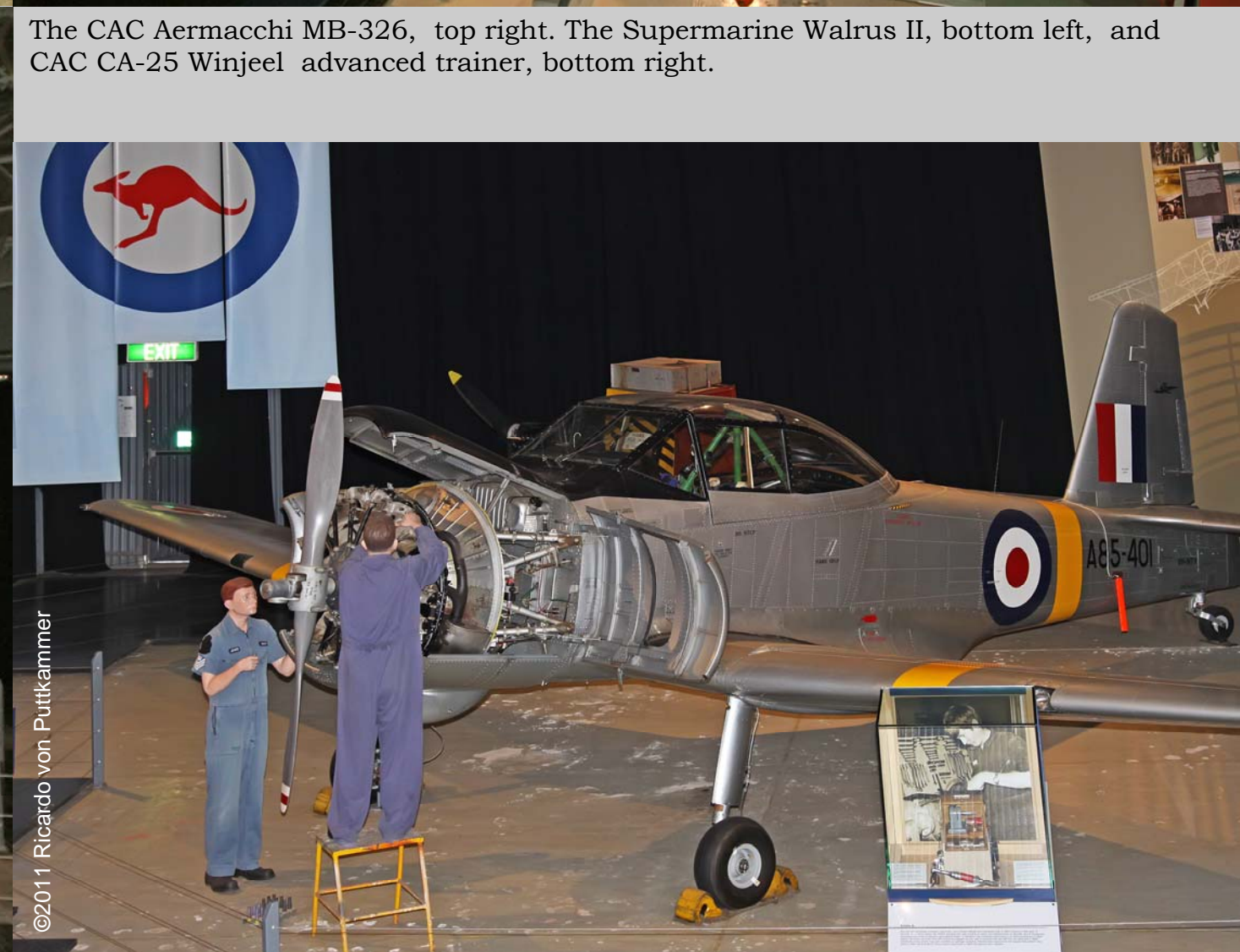
The CAC Aermacchi MB-326, top right. The Supermarine Walrus II, bottom left, and CAC CA-25 Winjeel advanced trainer, bottom right.